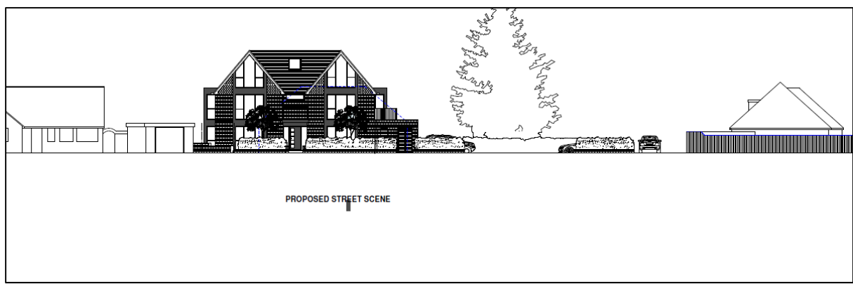
Figure 4: Streetscene elevation