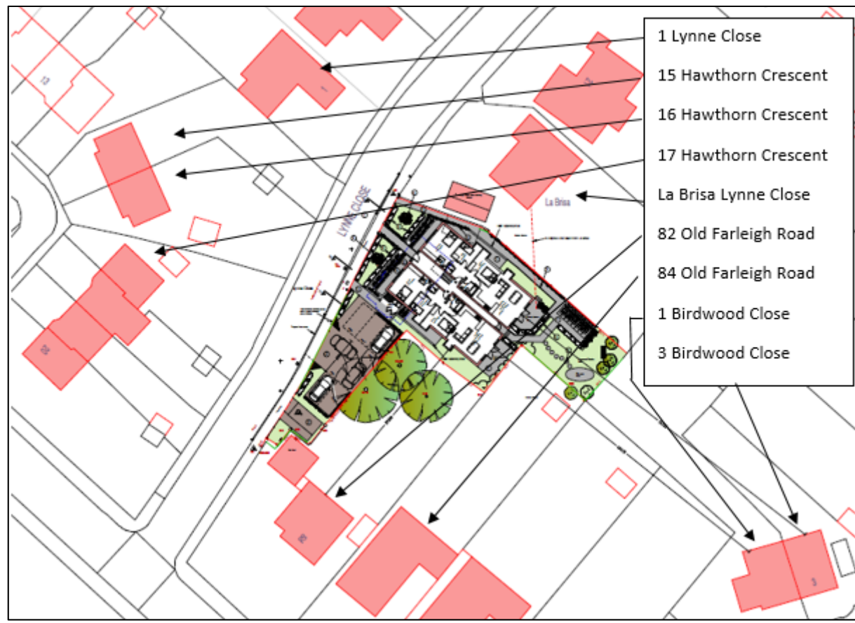
Figure 6: Proposed Block Plan