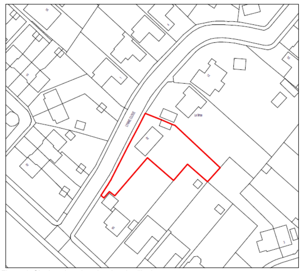
Figure 1: Site location plan showing dwellinghouse.