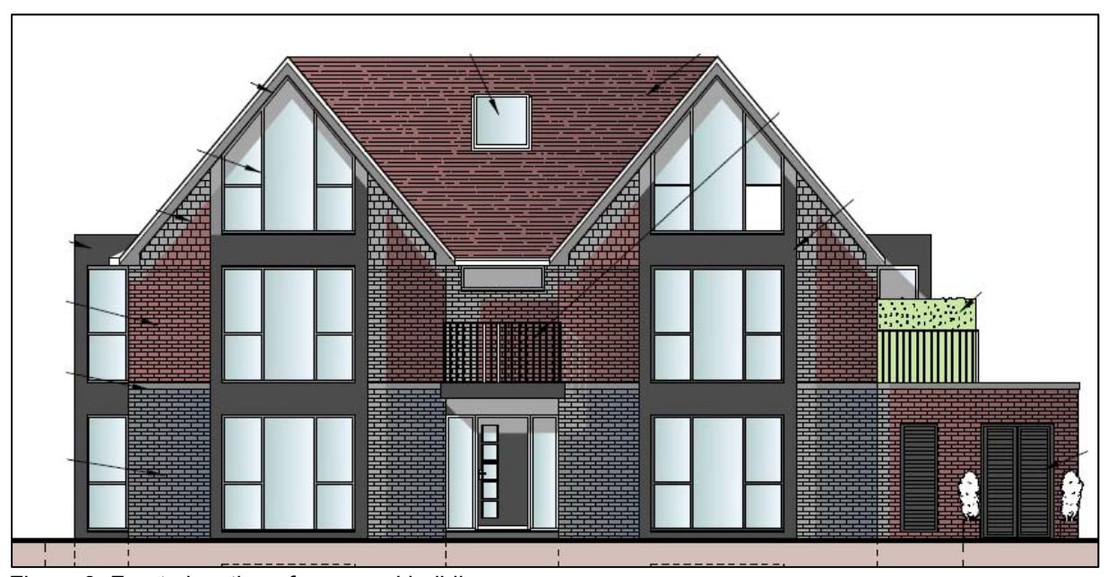
Figure 3: Front elevation of proposed building.