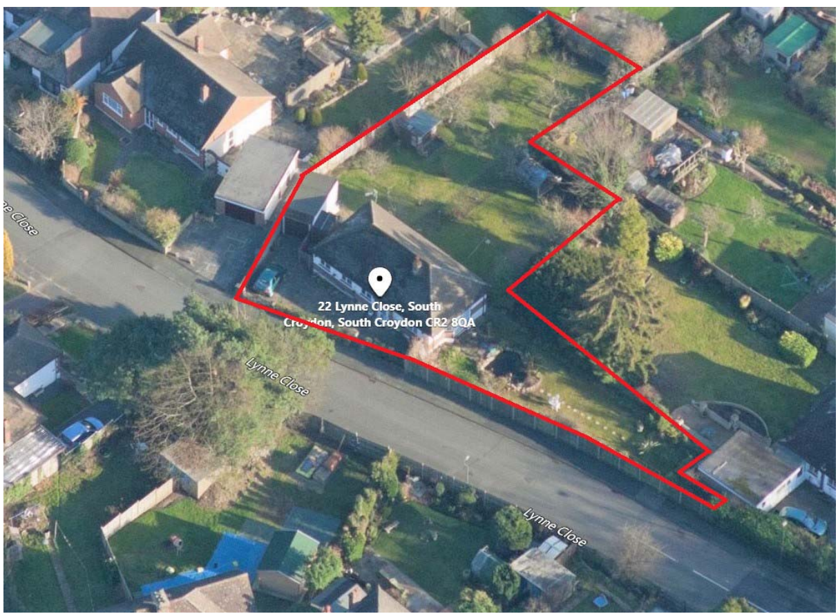
Figure 2: Aerial street view highlighting the proposed site.